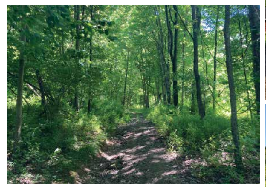
Auction By Order Of: Chelsea N. Ellis

TERMS ON REAL ESTATE: 10% down auction day, balance due at closing. A 10% buyer's premium will be added to the highest bid to establish the purchase price. Any desired inspections must be made prior to bidding. All information contained herein was derived from sources believed to be correct. Information is believed to be accurate but not guaranteed.